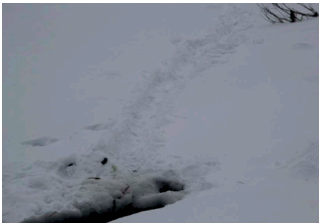
Figure 2. Otter tracks between two ice holes, Numrug River, November 29, 2012.