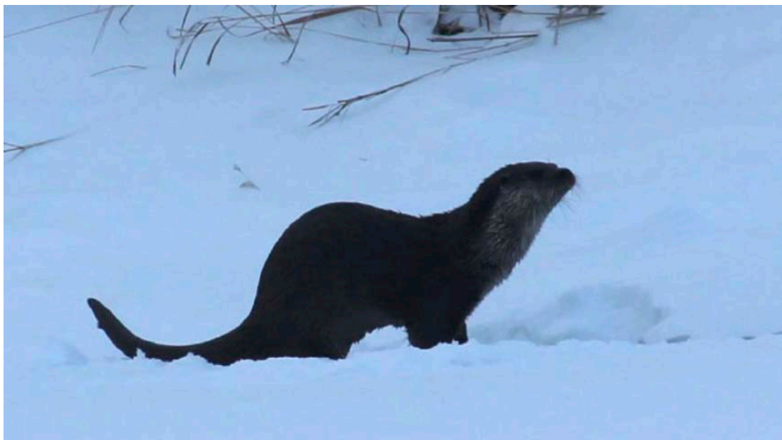
Figure 3. Otter observed at the Numrug River in Eastern Mongolia, November 28, 2012